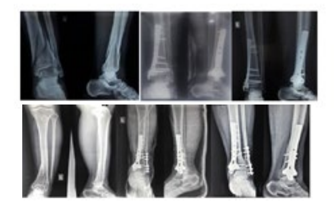
One patient in Group A showed delayed union at 9 months and autologous iliac crest grafting was done.

Figure 2 : Preoperative, post-operative and post-union radiography of avobe and Group B pacients below.